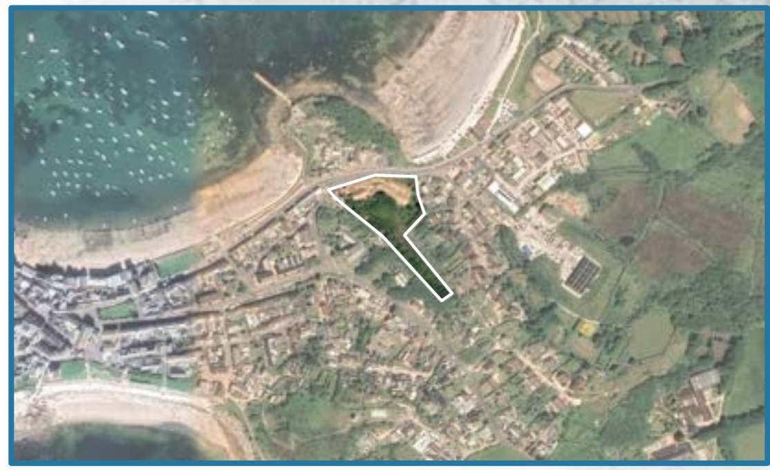
Located along Telegraph Road (A2111) being the main road into Hugh Town, the site which has been designated for residential development in the Isles of Scilly Council's housing strategy presents not only a sustainable edge of settlement development, but also forms an informal gateway into the town.

“ Scilly is about living in balance - within a very defined and remarkable natural and man made environment. ” The IoS Design Guide