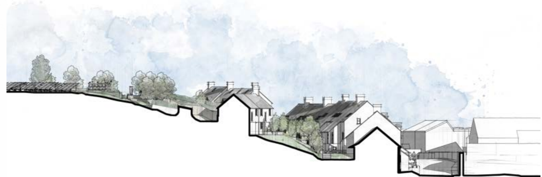
Section B B